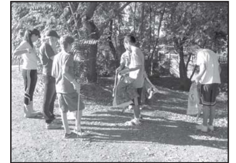
Cleanup volunteers discuss their strategy before they get started at Napa Creek.

September 25 th , 2010 was the 26 th Annual California Coastal Cleanup Day, the statewide effort coordinated by the California Coastal Commission to clean trash and debris from California's coast, bays, creeks, rivers, and lakes. Over 78,000 volunteers across the state of California combed 800 beach and inland locations and gathered over 848,637 pounds (424 tons) of trash statewide!