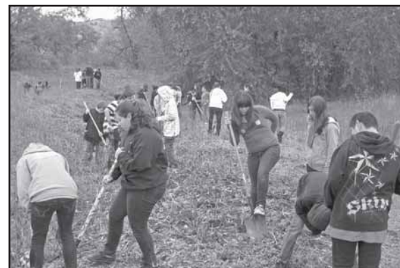
Harvest Middle School students digging up invasive teasel plants.

Just a week later, 300 seventh grade students from Harvest Middle School visited the Eco Reserve to help remove more teasel and euphorbia. The students also collected oak acorns and black walnuts and planted oak seedlings near the entrance to the site. Students learned about native plants in the reserve and conducted a creek water quality survey that was designed to show the kids what scientists study to determine the health of a stream. Members of the Napa-Solano Audubon Society led the students on a walk to see and identify some of the bird species that live in the reserve.