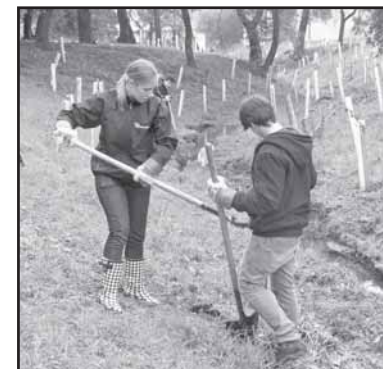
New Tech High students performing restoration work at Scott Creek.